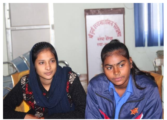
: Adolescent girls during FGD at Bara

Even though the cases of Gender Based Violence (GBV) are not often officially reported, the key stakeholders consulted highlighted that they have heard of many GBV cases happening in their community. One of the health workers in Lumbini province highlighted that they have heard of many cases, however they are never reported through formal channels which makes it difficult to address the issue. While GBV cases were present in the community, unfortunately, none of the municipalities had GBV policies in place and only claimed to celebrate the 16 days' campaign on GBV. A few mentioned that although they don't have a GBV policy they do have a Gender