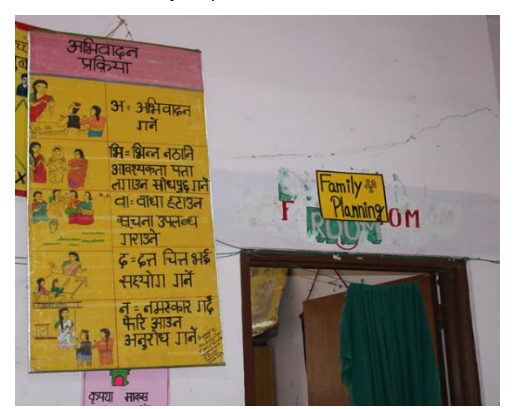
Health Facility in Banke with a separate room for family planning counselling

Adolescent boys (both married and unmarried) have witnessed their friends visiting health facilities or