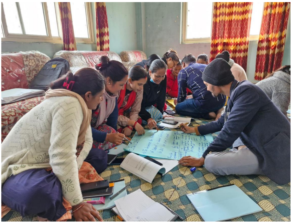
Development of AIMS statement during mentorship of QI module USAID ARH for USAID Nepal

HUB-AND-SPOKE MODEL: Clinical Mentorship for Adolescent-Friendly Services USAID Adolescent Reproductive Health (ARH)